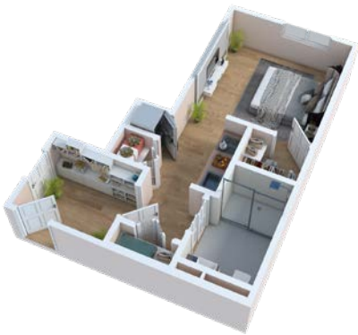
Marsol Alcove Studio