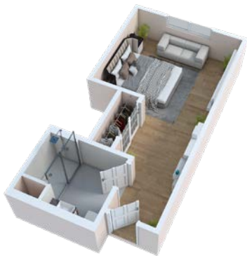
San Vicente Studio

Explore our thoughtfully designed floor plans to find the perfect space that suits your style and needs. Each layout offers a blend of comfort and functionality, creating a welcoming environment you'll be proud to call home.